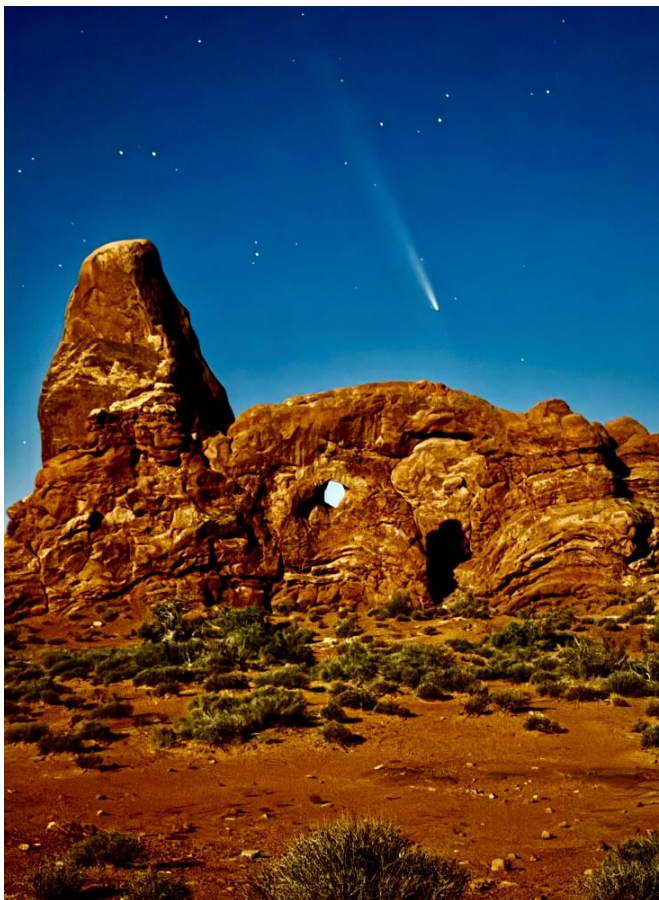
Wally Pacholka - taken in Arches national park, Utah Copyright Wally Pacholka