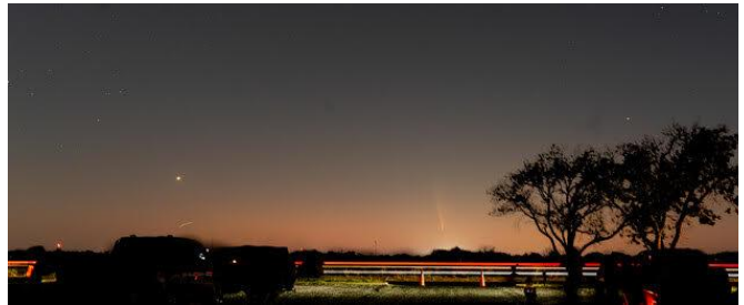
Craig Bobchin - taken at Stonewall, Texas Copyright Craig Bobchin