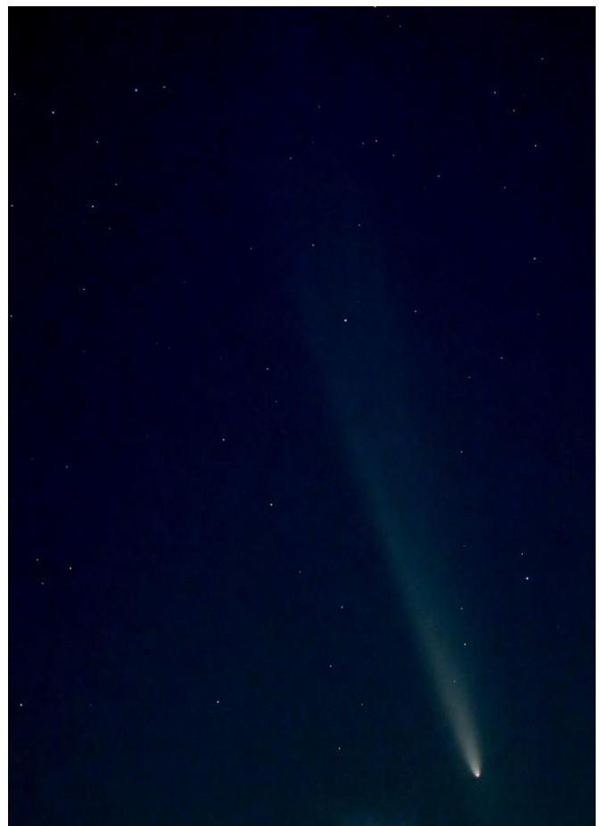
Alan Lang at Palos Verde peninsula