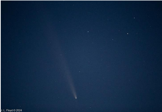
Jerry Floyd - taken at OCA Anza site