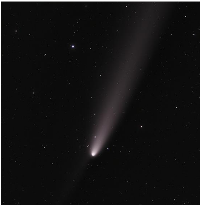
Eric Goodnight - taken at Crystal Cove park Copyright Eric Goodnight