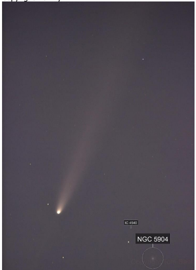
Tom Bash - taken at Huntington Beach Copyright Tom Bash