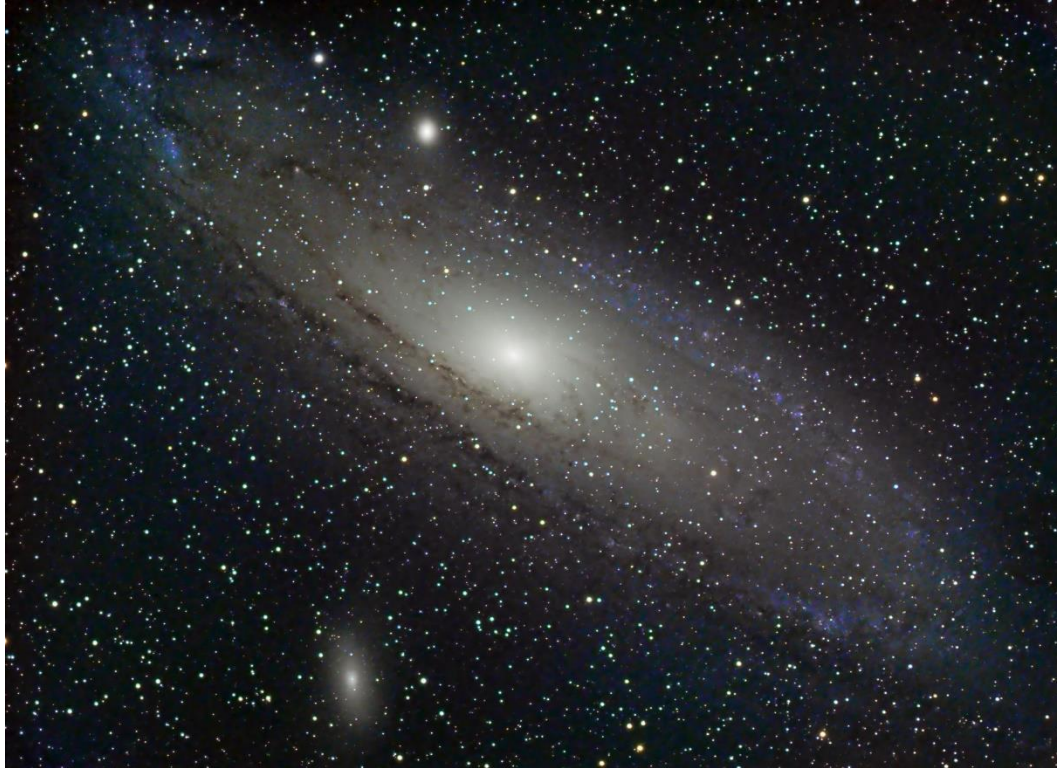
M31 the Andromeda galaxy imaged by Alan Lang from his yard in Long Beach in November 2020 using SkyWatcher Esprit 100mm refractor and ASI1600M camera with filters for red, green, blue and H-Alpha bands

Because of the COVID-19 crisis and ongoing efforts to reduce exposure to the virus: