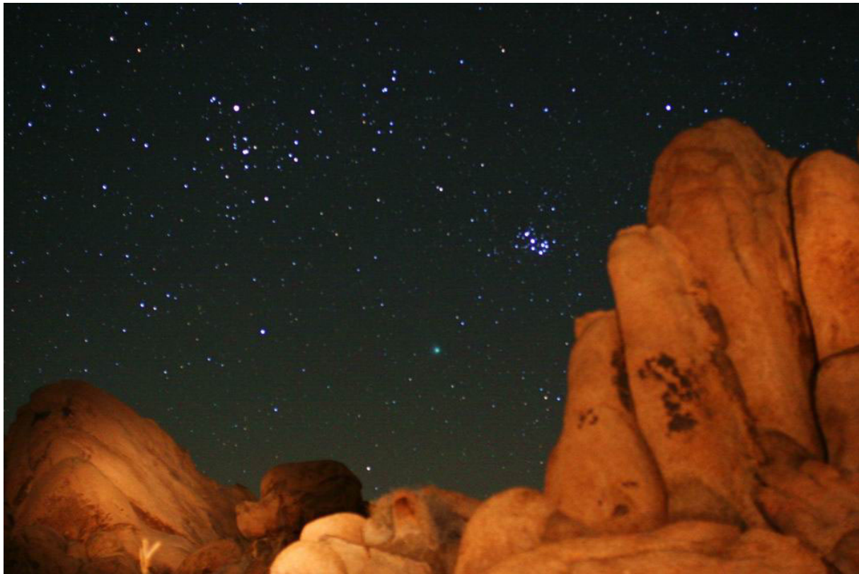
Comet Machholz with Taurus and the Pleiades, taken from Joshua Tree National Park's "Wonderland of Rocks" on January 5, 2005. This photo was taken with a Canon 20d w/35 mm lens at f/2.0 and ISO setting 1600, 20 second exposure